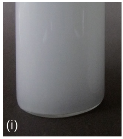
GT 930, 0.8% active with 5% Titanium dioxide. Three month stability.