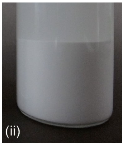
Standard thickener solution, 0.8% active with 5 % Titanium Dioxide.